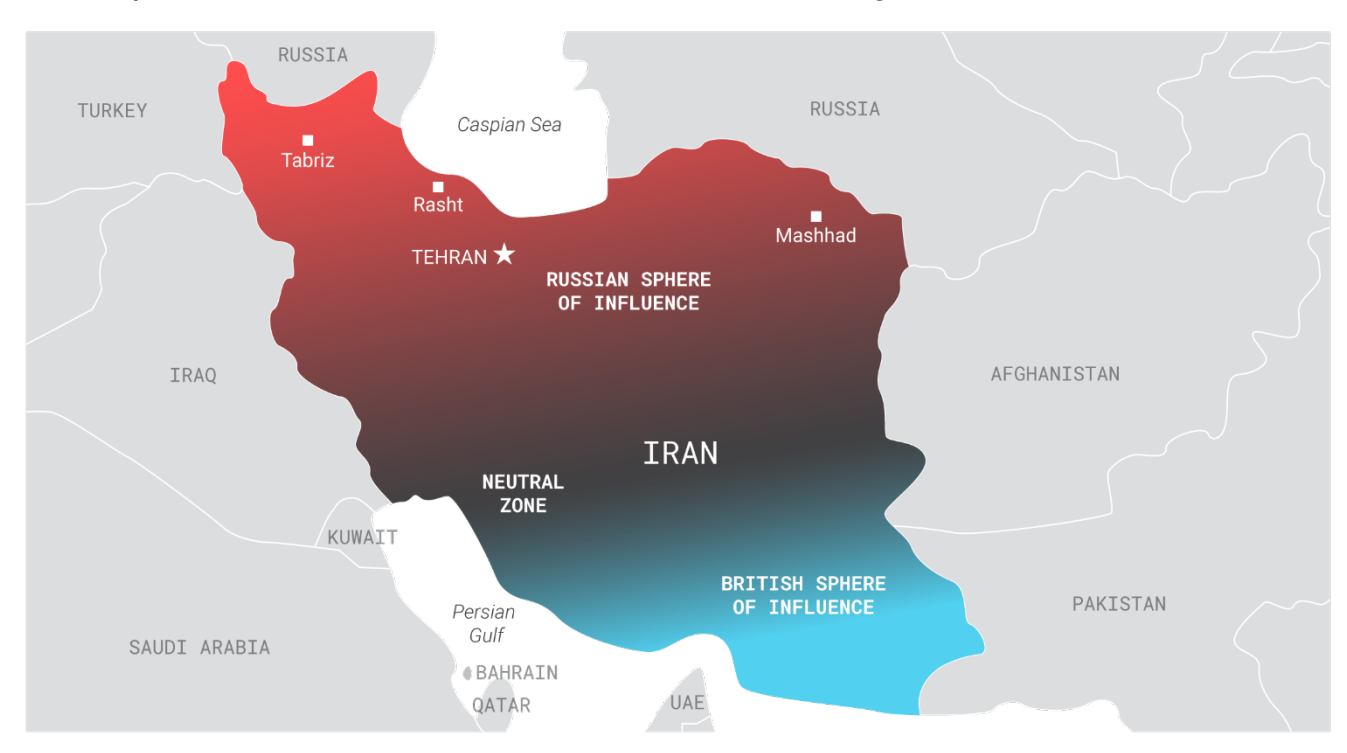
Sphere of influence in Iran after the 1907 Anglo-Russian Convention

Despite their near ubiquity, the form and function of spheres of influence is not the same across time and space. As with all such mechanisms, spheres have tended to bear the imprint of the unique historical circumstances out of which they arose and within which they operated.