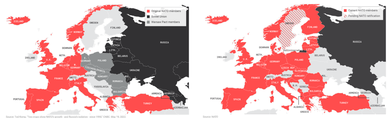
Europe's major military alliances in 1990 (left) vs. 2023 (right)

This is not to justify the invasion or suggest it resulted due to legitimate security concerns. It is rather to note that Ukraine joining NATO, or getting NATO's protection less formally, was a Russian "red line," as so many officials and scholars warned.<sup>55</sup> It strengthened Russia's desire to forcibly seek to control Ukraine, particularly Crimea, to keep it out of the Western sphere.<sup>56</sup>