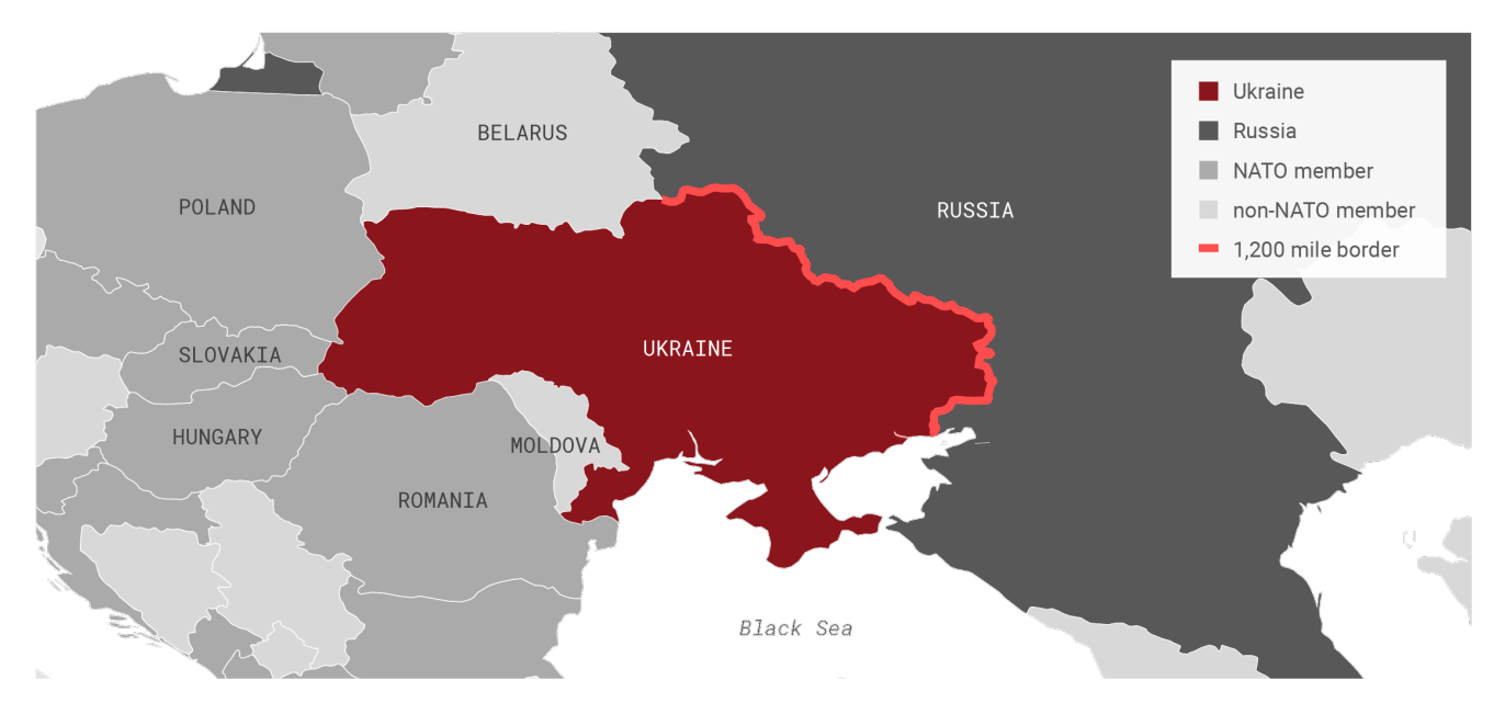
Ukraine's land border with Russia

stop Russia's seizure of Crimea in 2014 or broad advances in 2022. This manpower, like other U.S. capabilities dedicated to Ukraine, would not be available for other contingencies more important to U.S. security.